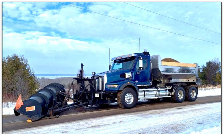
2024 Western Star Plow Truck