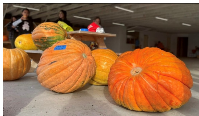
Giant Pumpkins – Grand Champion weighing in at 187 pounds.

Council and Recreation have encouraged the revitalization of many sub-committees, as some had unfortunately gone virtually dormant during the COVID crisis. This revitalization effort has been