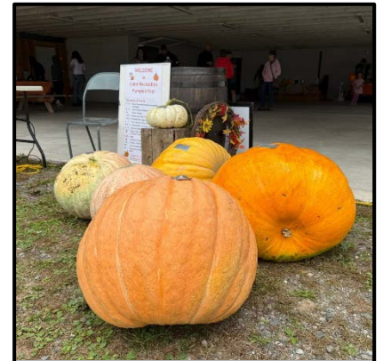
Pumpkin Fest Giant Pumpkins – Grand Champion weighed 593 lbs.